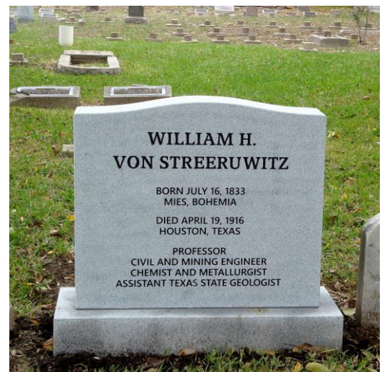
View towards road