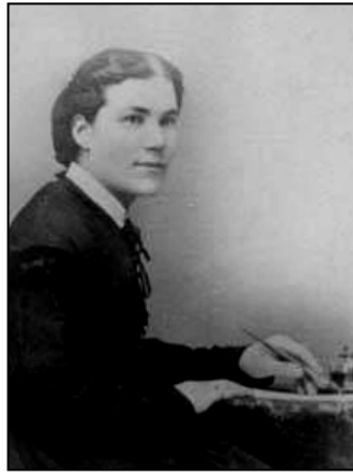
Sarah Emma E. Edmonds

Sarah Emma Seelye was mustered into the George B. McClellan Post No. 9 in Houston in 1897, thereby becoming the only woman ever to join the Grand Army of the Republic (GAR), the Union soldiers' veterans organization, though well over a hundred women served in the Union army.